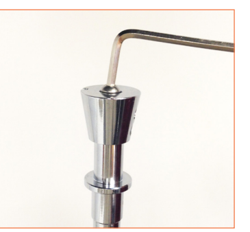
Congratulations! You have successfully installed the replacement T-shaped hanging pole connector.

Install and screw the hanging pole knob until it is tight.