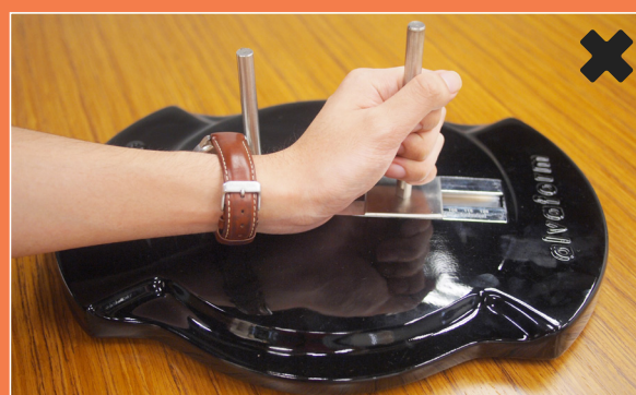
Table top stand can be scratched by hard objects such as watches.